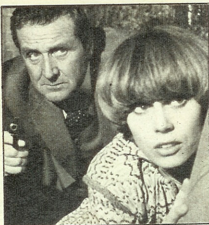
8.0 In a tight corner: Steed (Patrick Macnee) and Purdey (Joanna Lumley). The New Avengers .

Ah yes, and there's also the return of The New Avengers (ITV, 8.0). Tonight's plot (in most regions): John Steed (Patrick Macnee) is being subjected to a perverted kind of persecution from a nutter out for revenge and rather addicted to electronic devices (blowing up detectives, for the use of).